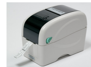
Tag printer and label tags

The HÜRNER movement pushbutton fitted to the basic machine chassis allows moving the machine carriage when the welder stands next to the chassis. This enables convenient welding without constant back-and-forth between the hydraulic and control box and the machine chassis.