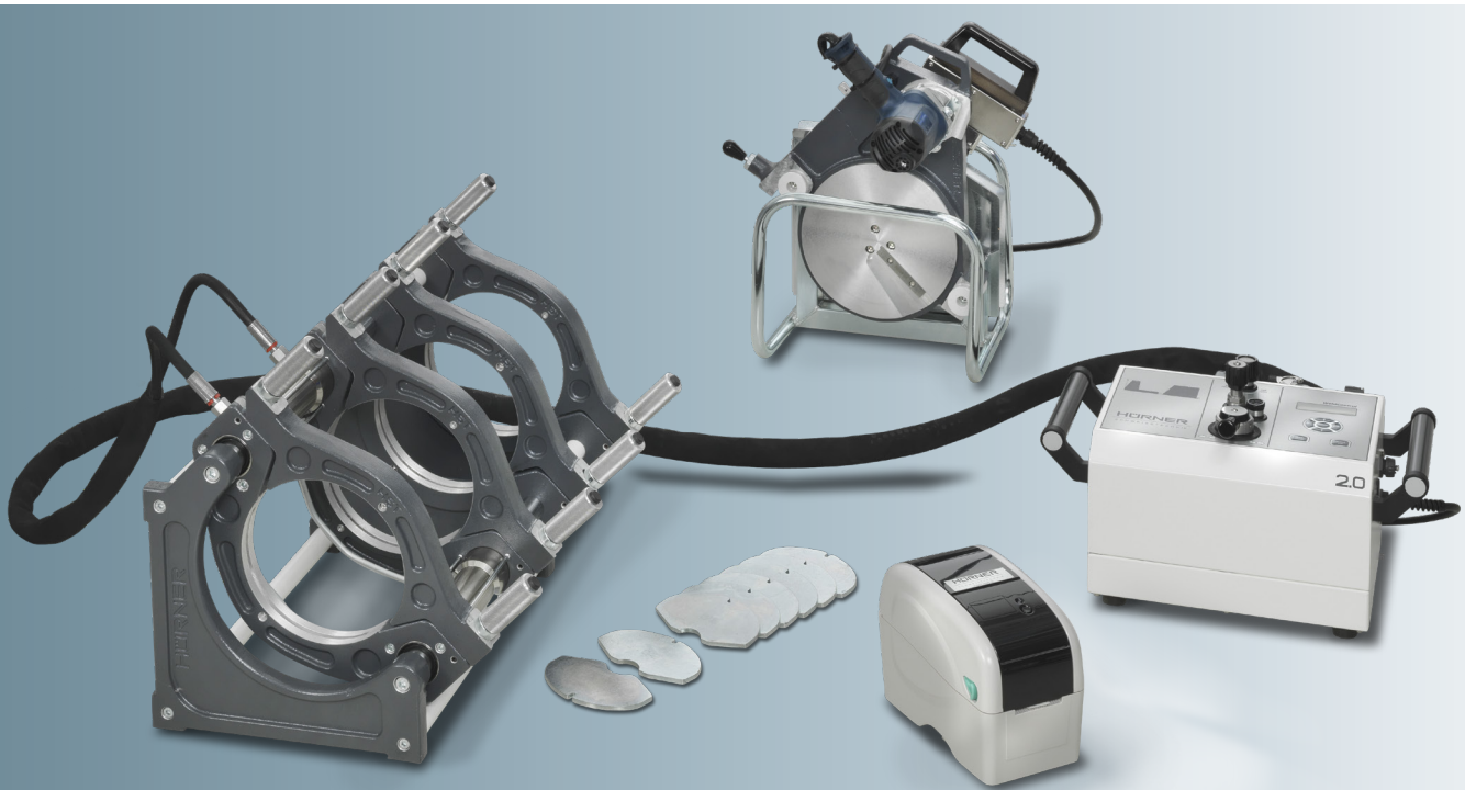
Stand-alone in Butt-Welding