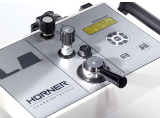
Front panel with GT keypad