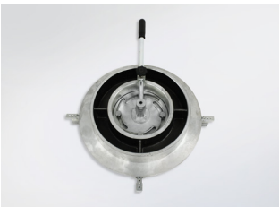
Welding neck support