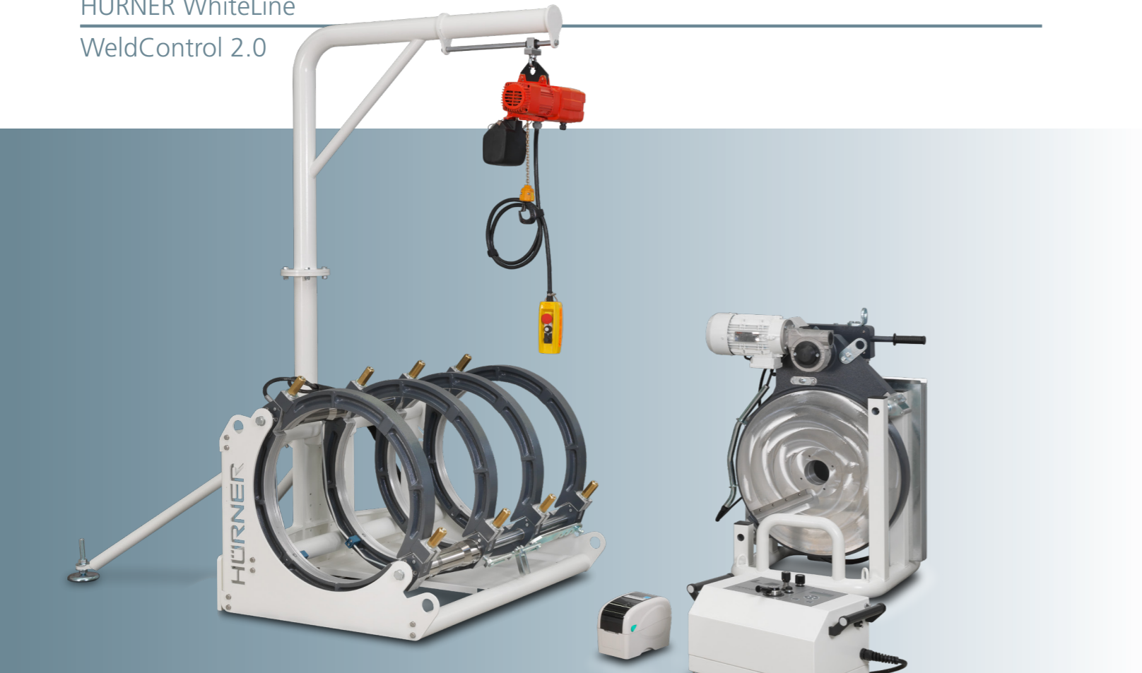
Stand-alone in Butt-Welding