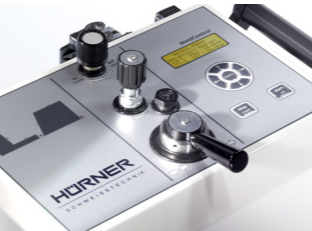
Front panel with GT keypad